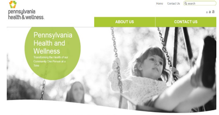
Introducing Pennsylvania Health and Wellness-your partner for success